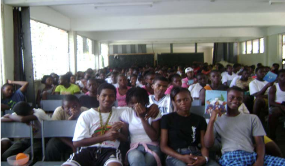
OCA representative making a presentation to participants at the St. Catherine Inter-School's Brigade Annual Summer Training and Behaviour Modification Camp at Glengoffe High School.

The other four consultations were conducted with church leaders. These were partly funded by UNICEF and were conducted regionally (Montego Bay, Ocho Rios, Mandeville and Kingston) and included representatives from all parishes. Over 15 denominations including SDA, Methodist, Anglican, Catholic, Pentecostal, Open Bible, AME, Missionary and the United Church spanning over 100 local churches were reached. The consultations were designed to provide information regarding the rights and responsibilities of children, role, functions and location of the Office and extract information from participants to inform the work of the Office and to build partnerships with the church community.