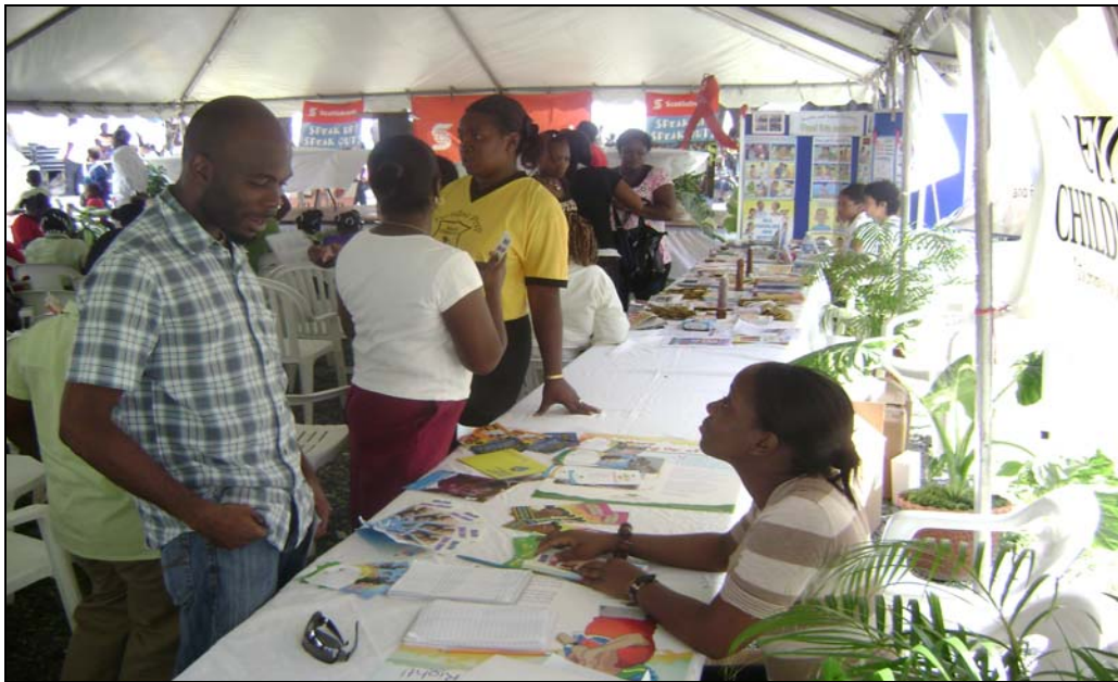
Public Education and Special Projects Manager interacts with patron at OCA's Display Booth at the Scotia Bank Speak up Speak Out Campaign in St. Thomas during Child's Month

With the assistance of the Environmental Foundation of Jamaica, the Office was able to run its PSA on Child Abuse during child month which the public received well. Many follow-up calls and personal feedbacks were received from the public. The OCA also recognized Love Television which continued to air its advertisement even after the funding ended.