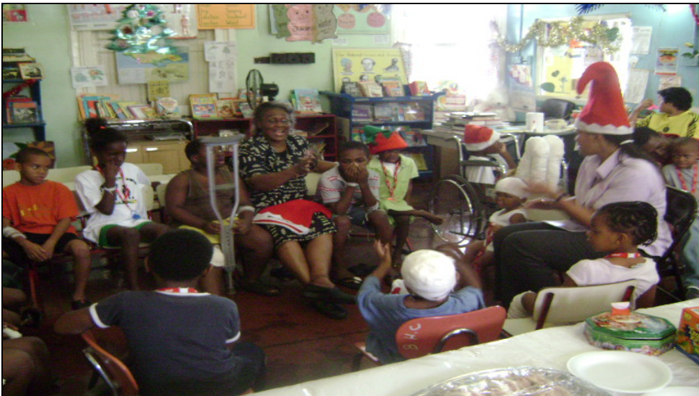
OCA's Staff members singing Christmas Carols to Children at the Bustamante Hospital